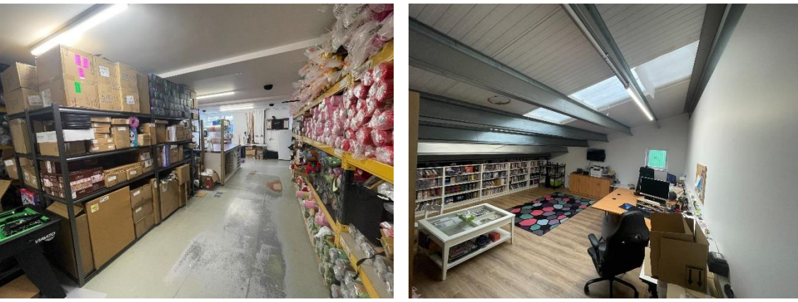
OFFERS IN THE REGION OF £230,000