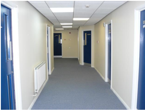
Internal Corridor serving office suites

First Floor High Quality Office Suites Available on an All Inclusive Basis - Private Car Parking Available GREAT DEALS/FLEXIBLE TERMS Rents from £50 per week inclusive